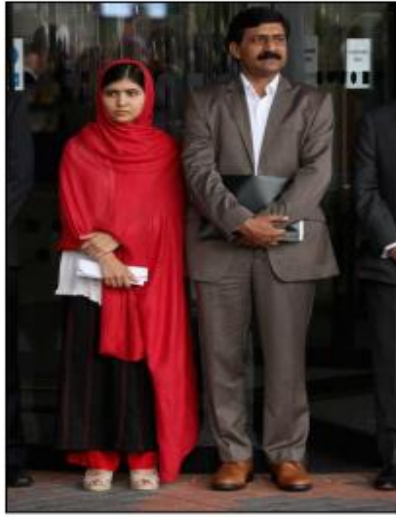
(September 2, 2013)

Around the time Malala's father began college, General Zia was killed in a plane crash, which many suspected to have been caused by a bomb. Benazir Bhutto, the daughter of the prime minister who was executed following General Zia's coup, was elected president, becoming the first female prime minister of Pakistan and the first in the Islamic world. When Bhutto was elected, much of Zia's Islamization efforts were rolled back. Benazir Bhutto would be assassinated in a bombing in 2007.