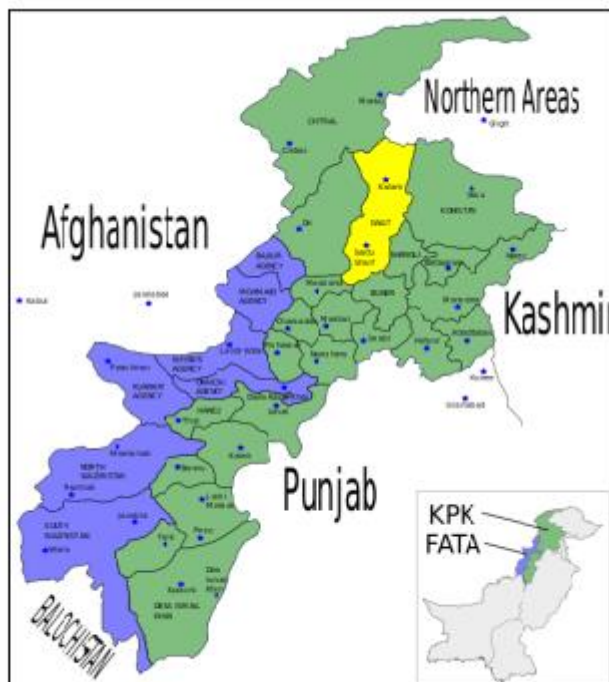
(Map Showing the Location of Swat District)

The Swat Valley, Malala' Yousafzai's hometown, is known for its mountains, meadows, and lakes. Tourists often call it "the Switzerland of the East." The Swat Valley was the home of Pakistan's first ski resort.